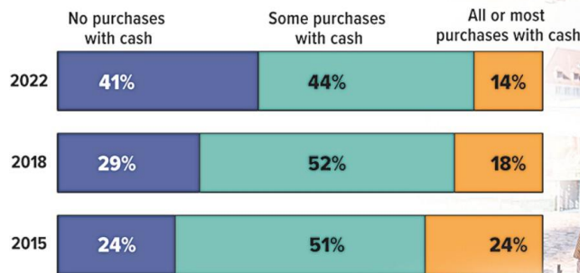
Percentage of Americans who use cash in a typical week for everyday purchases

(numbers do not equal 100% due to rounding)